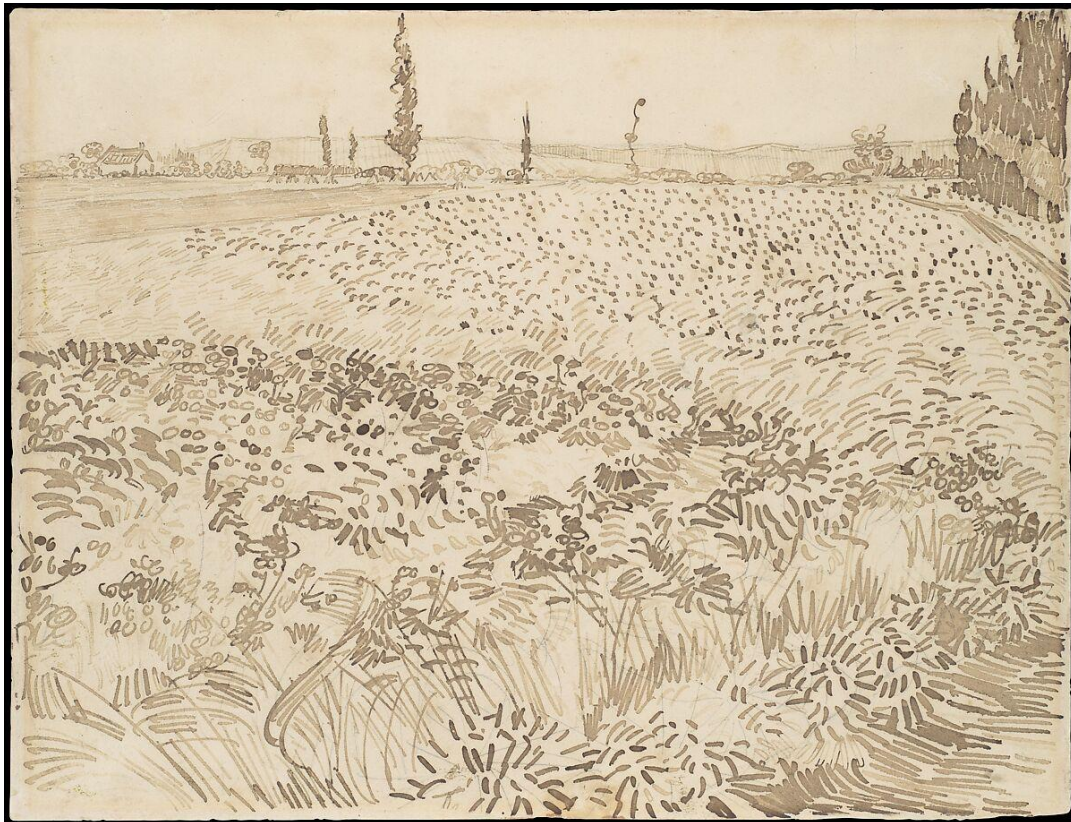
Wheat Field, Vincent van Gogh, July 1888