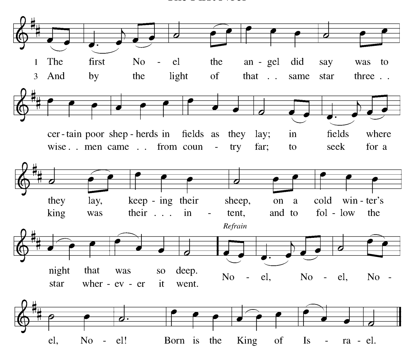
The First Noel